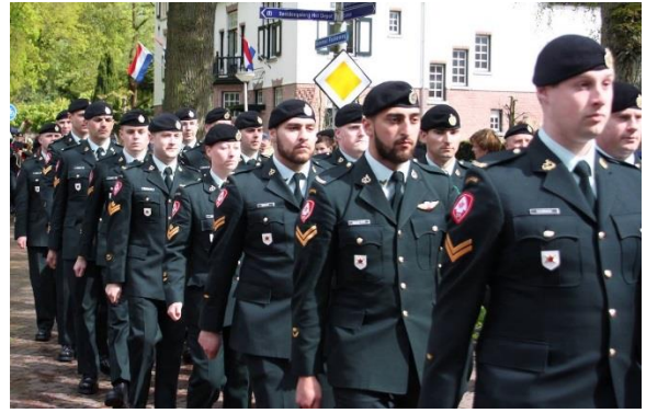
Serving soldiers on parade.

The final two days were spent in Amsterdam, where the Regiment did all of the "touristy" things expected of visitors. We did visit the Resistance Museum which is in the former Jewish area of the city. Almost 400,000 Jews were deported to the death camps from Holland and fewer than 10,000 returned. During our guided walk we saw the places of deportation, places of hiding and most poignant of all - small brass plaques embedded in the sidewalk outside of houses where people had been living. On each plaque were their names, date of deportation and what happened to them.