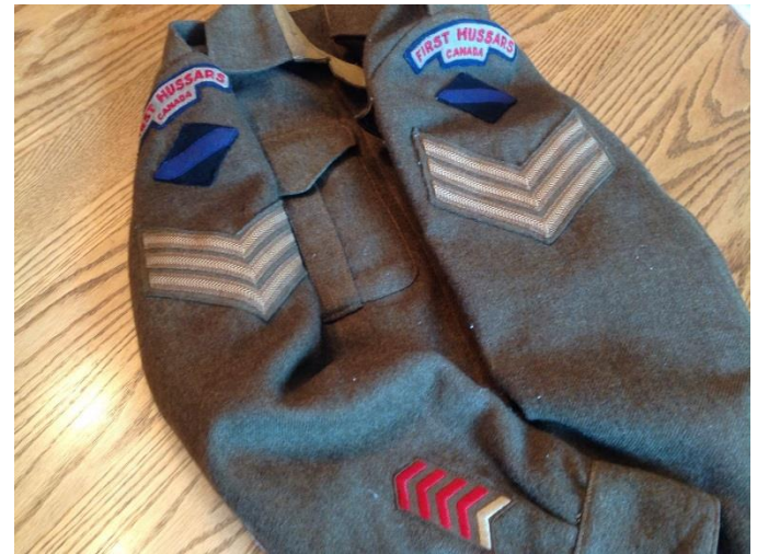
Chet's battle dress