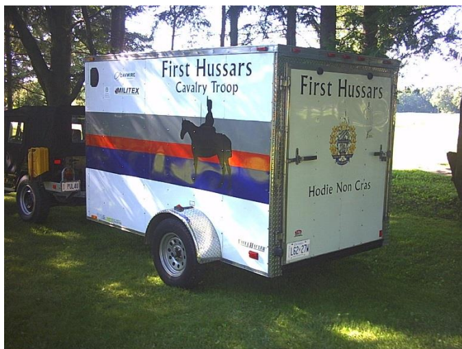
New enclosed trailer thanks to our generous sponsors.

I must thank the generous donors that provided the Cavalry Troop with an enclosed trailer. This has been a real blessing for moving the Troop's kit around. It functions as a portable Quartermaster's Stores from which we can rapidly kit out each trooper. The trailer's graphics are a real eye catcher and with a little spit and polish, it really shines. Volunteer work on the trailer is progressing as time permits. Wheel bearings were on the top of the list. Next came a clean-up and waxing. Some wiring issues have been rectified. Pitted aluminum trim is getting polished by hand. A rack for 12 lances has been installed against the ceiling, thus securing the lances for safe transit. There are some more improvements and upgrades coming to further improve the efficiency of the trailer and securement of the kit.