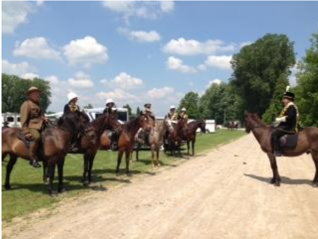
The Cavalry Troop in Rodney, Ontario

On Canada Day 2015, The 1st Hussars Cavalry Troop rallied to the call at London Ontario's Harris Park for the mid-day celebrations. Dress for the day had the Troop Leader and Colour Party in Victorian ceremonial dress uniforms with busbies. The remainder of the troop wore WWI uniforms. The mounts were as varied as one could expect from calling out a "militia troop", just like the original Troops of London, St. Thomas, Courtright, and Kingsville. There were quarter horses, a cheval Canadien, and an everfaithful mule. (Yes, mules function quite well in the cavalry.) Our beloved Mounted Troop had the honour of carrying the Dominion of Canada's red ensign flag. Our ground support staff was quick to react to any need or immediate response to a discharge of horse muck. We were treated to a fly-over of four Harvard aircraft. No one was more surprised by the aircraft than the horses. All seven startled and three of them literally had the "poop scared out of them". As the aircraft circled the park, the mule, the cheval Canadien and four of the horses stood their ground. One horse was unsure of the noisy yellow flying beasts and was skittish until the aircraft departed. The Troop handled their mounts quite well under these conditions.