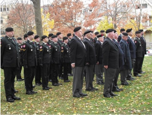
Present and past Hussars stand together at Holy Roller.

On Sunday, November 9 th 2014, both past and present 1 st Hussars gathered in remembrance as they do every year, but this year was unique.