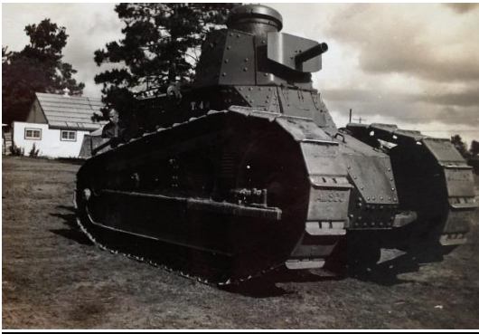
Scrap metal for training – A Renault at Camp Borden.